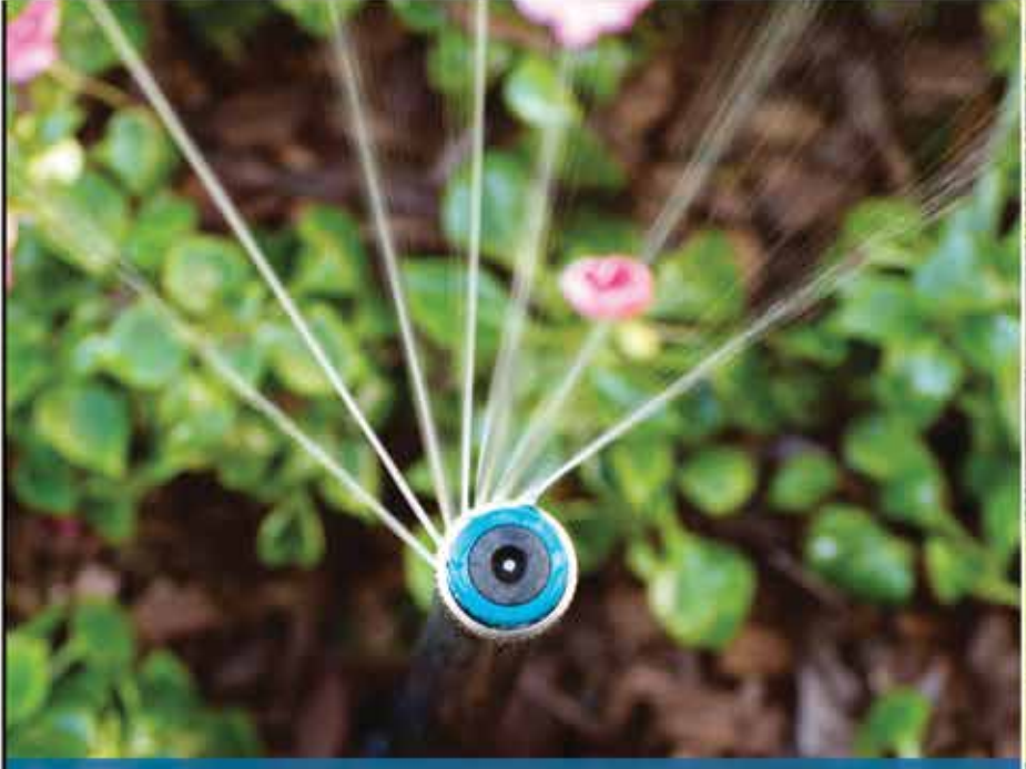
Horizon Distributors is one of the largest wholesalers of irrigation supplies in the U.S. With strategic partners like Hunter, Rain Bird, Toro, Lasco, NDS, ADS & more we have everything the irrigation contractor needs to get the job done.

Horizon has the products you need, when you need them—all under one roof.