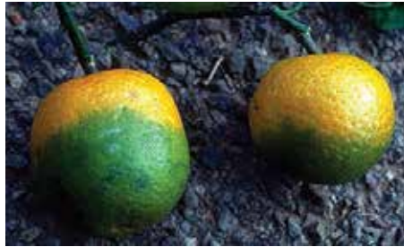
Oranges afflicted with Citrus Greening Disease.

greening-tolerant Australian finger limes, which has been consumed for hundreds of years,” Jin said. “It is much safer to use this natural plant product on agricultural crops than other synthetic chemicals.”