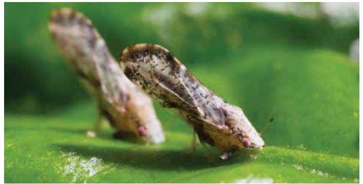
The Asian citrus psyllid, pictured here, spreads the bacterium that causes Citrus Greening Disease.