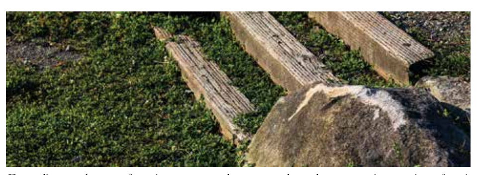
Depending on the manufacturing process and age, treated wood may contain a variety of toxic substances, including arsenic, chromium, copper, pentachlorophenol, and creosote.

After December 31, 2020, all treated wood waste "that exhibits the hazardous waste characteristic of toxicity will be a fully regulated hazardous waste and will no longer be eligible for disposal in Class II or Class III landfills," a fact sheet from